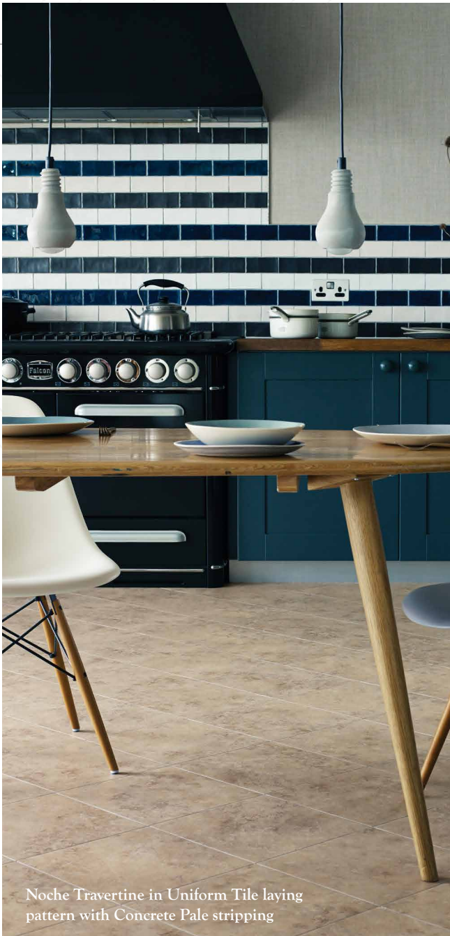
Noche Travertine in Uniform Tile laying pattern with Concrete Pale stripping