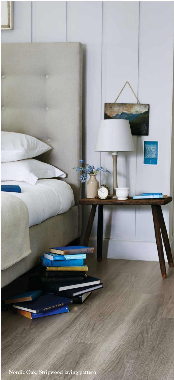
Nordic Oak, Stripwood laying pattern